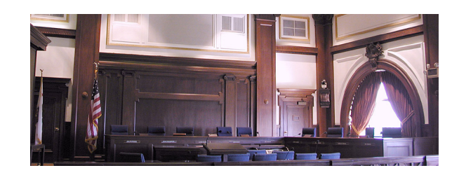
City Council, board and commission study sessions to share what the future could look like and gather feedback from decision-makers