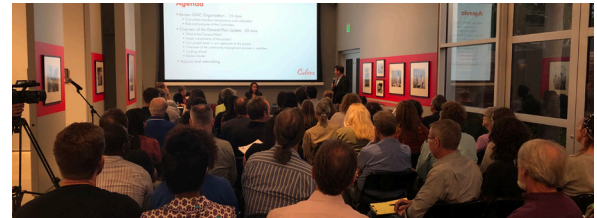
Development of a General Plan Advisory Committee to help guide the process