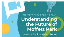
Educational videos and events with guest speakers on specific topics of interest

Hear a few words from the Moffett Park Specific Plan's project manager as she introduces the series: