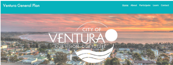
Project website with information and updates

The City will host many events and activities to engage Ventura residents and stakeholders. These activities will be designed to allow the public to participate in a way that is easy, user friendly, and accessible to everyone. Some of the key activities that will occur throughout the process are: