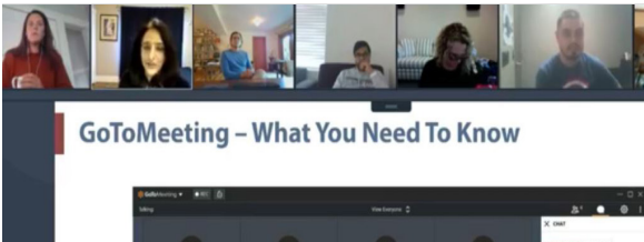
Safe, in-person and virtual public workshops and open houses, for citywide topics and individual neighborhoods