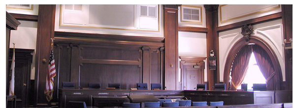
City Council, board and commission study sessions to share what the future could look like and gather feedback from decision-makers